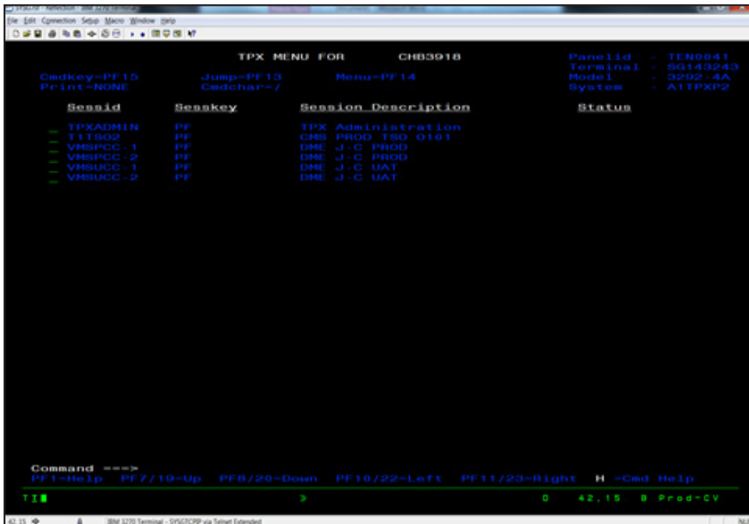
Figure 2 – Selection Screen